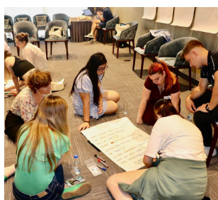
"The Regional Youth Exchange" organized by YHIR KS