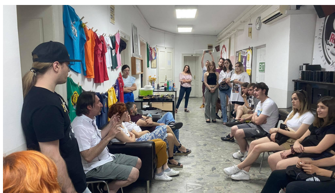
"How do I see you?" organized by Doku Fest

The promotion of youth exchanges appears as a major tool with the potential to significantly overcome the problems between Kosovo and Serbia. These exchanges provide a unique opportunity where young people from both countries can engage in meaningful interactions, share personal stories, and create true friendships. Facilitating joint initiatives, cultural exhibitions and collaborative projects, these exchanges have the power to see up close what the reality is, what the situation is and help to see the role of politics in this. These initiatives provide a unique chance to challenge stereotypes and long-held prejudices to help bridge the divide. (Ozcelik et al, 2021). These exchanges serve as a channel for overcoming past histories, allowing participants to create new friendships and histories to discover common aspirations. As these exchanges progress, participants usually develop friendships that last. (Guri, 2023) Youth exchanges have a transformative impact on young people (Žilić, 2023). These exchanges serve as boxes to challenge prejudices and misconceptions. Youth exchanges are a key strategy in overcoming the divide between Kosovo and Serbia. These exchanges not only challenge stereotypes and prejudices, but also cultivate a shared spirit of cooperation and a sense of collective identity.