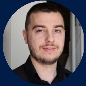
Miloš Pavković European Policy Centre (CEP)