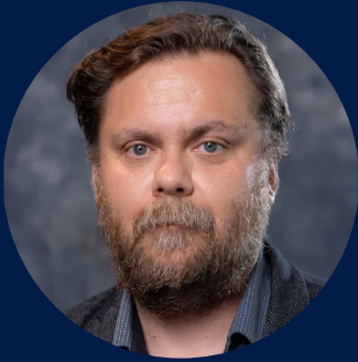
Misha Popovik Institute for Democracy Societas Civilis Skopje (IDSCS)