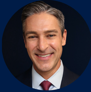
Damon Wilson The National Endowment for Democracy (NED)