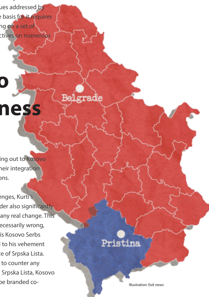
Illustration: Exit news

Regardless of these underlying factors, proposals of potential 'sustainable' mechanisms for integration and inter-ethnic cooperation are scarce. Building on a tangible plan that reconciles these critically different political positions with prospects of 'real' integration often seems practically impossible.