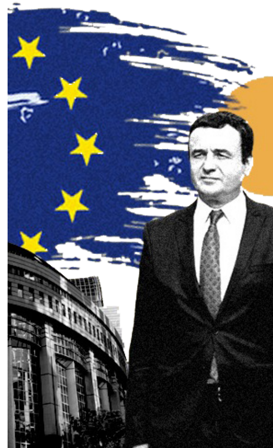
Illustration: Exit news

To evaluate whether Kurti engages in nationalist rhetoric for self-interested motives remains to be seen whether he can deliver on his commitments. Judging by the extent to which the genocide suit was presented, contextualized and justified by the government, Kurti has a long way to go in convincing the public.